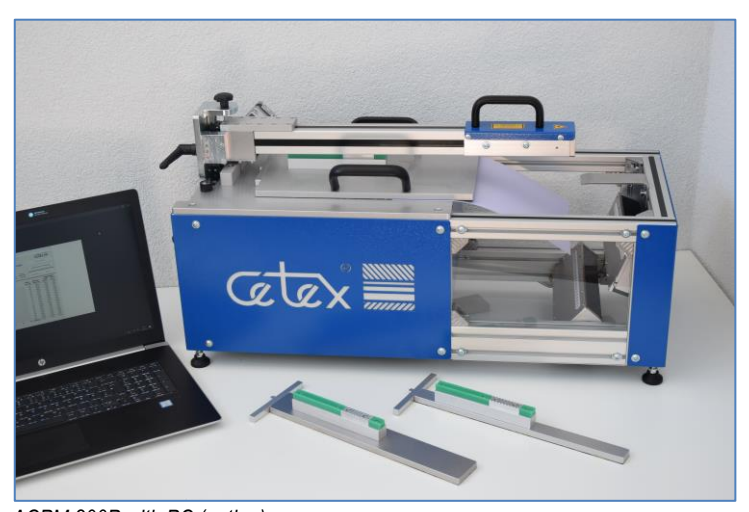
ACPM 200P with PC (option)